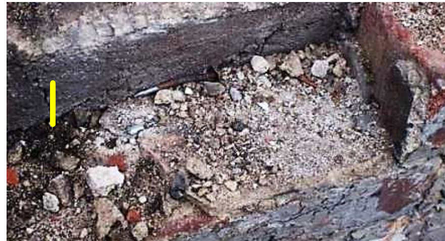
Beads of mercury inside masonry wall