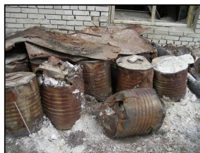
Poor environmental practices were common in the informal gold mining sector

The contaminated tailings were spread out on an impermeable ground and levelled to form a layer of few decimetres. The DTOX solution was then sprayed all over the surface of this layer by a special decontamination vehicle that belongs to the NEMA Special Rescue Unit. After the completion of the decontamination operations, the tailings and the solid waste were disposed of, along with the Boroo Gold mine residues.