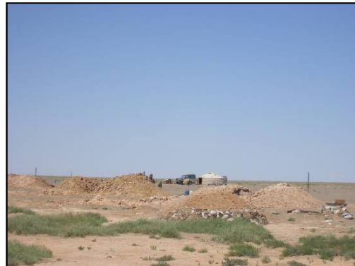
Abandoned tailings can increase pollution of soil and underground water

In the two locations visited, the tailing ponds were adjacent to soil depressions, which turned into large pools of standing water during rainfall. These pools are used as watering points for animals. Pollutants contained in the tailings can easily contaminate the standing water and subsequently enter the food chain.