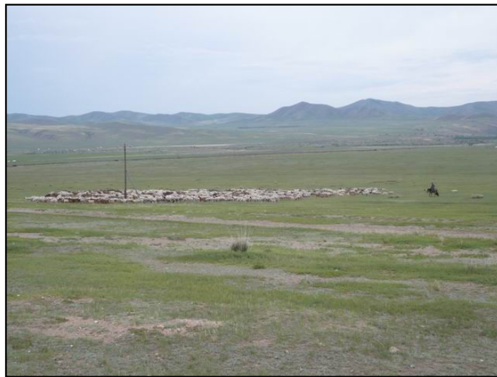
Mercury used in gold mining can end up in the food chain and cause long-term environmental and human health impacts