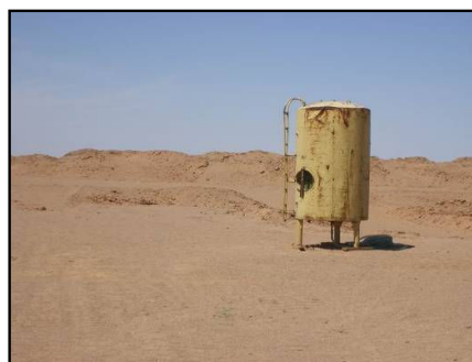
The health impact of informal mining practices requires attention

Because of the improper gold amalgamation operations carried out by the artisanal miners and because of the large number of unprotected tailings ponds scattered throughout Mongolia, extensive mercury contamination of the environment and subsequent exposure of the population is likely to occur in the future (through direct contact or through bioaccumulation and bio concentration). In order to enable the Ministry of Health to carry out an efficient monitoring of the health impact of the mercury in Mongolia, it is recommended to take all necessary actions to acquire the requested capabilities and/or equipment to test mercury in urine and blood samples. It is also recommended that the Ministry of Environment will liaise and exchange information on this issue with the Ministry of Health and World Health Organisation.