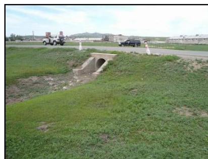
The mining spill is considered Mongolia's first major environmental emergency

Both installations were found contaminated by cyanides. The pipe that brings the effluent to the installation as well as the sedimentation basins were treated with sodium polysulfide until the wastewater was free of cyanides.