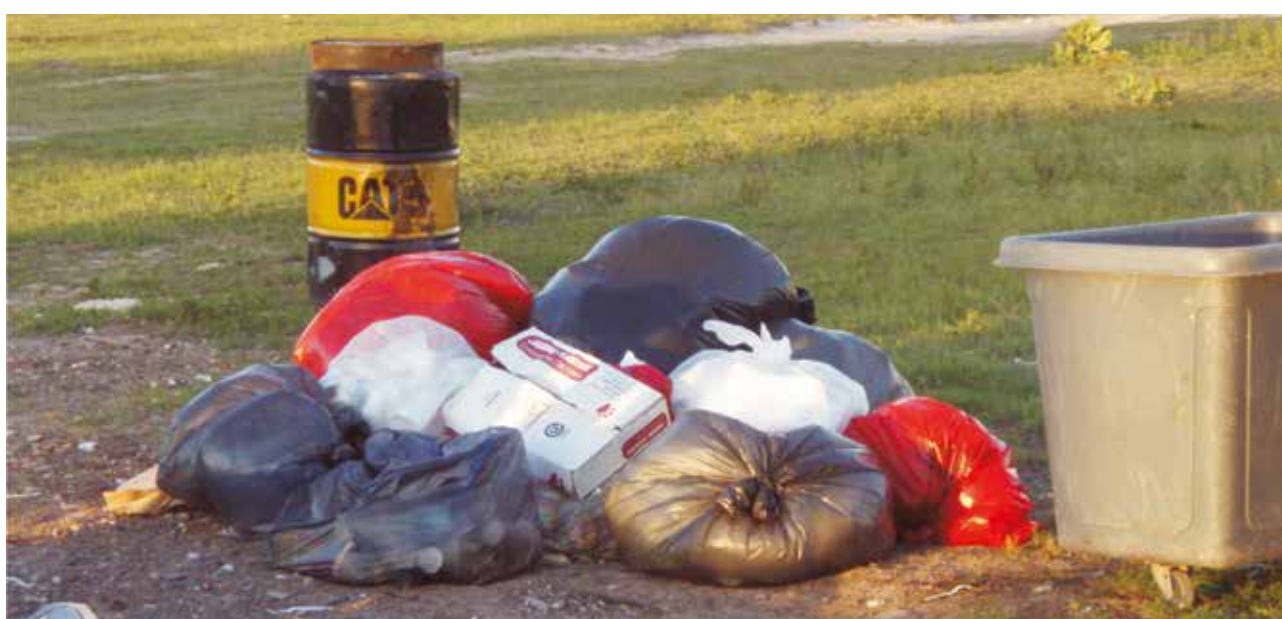
Mixed healthcare waste, including red bags indicating infectious waste, disposed of openly in post-hurricane Turks and Caicos Island 2008.