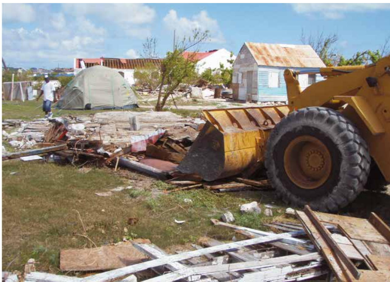
Clearing hurricane debris in post-hurricane Turks and Caicos Island 2008. Note the lack of appropriate equipment to segregate roofing and reusable boards.